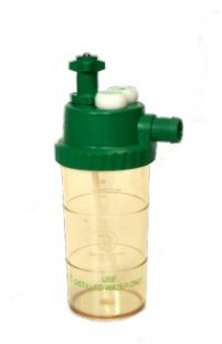
Nebulizer* P.N - 4103000