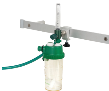
Rail Mounted Oxygen Unit