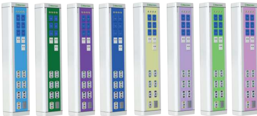
Side panel colored

Available in different colors according to customer's preferences.