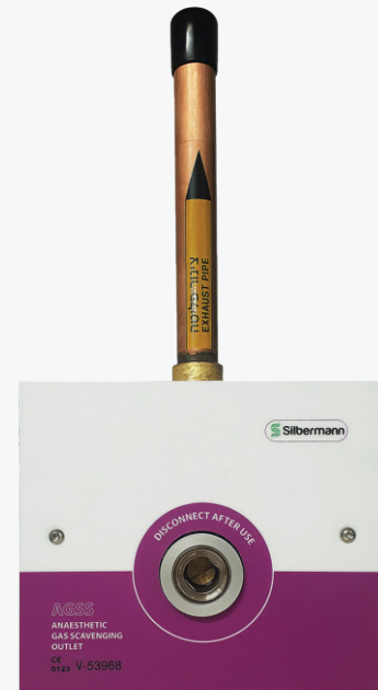
Anesthetic Gas Scavenging non venturi type Inlet and probe

It withstands pressure tests without the need for a dedicated plug.