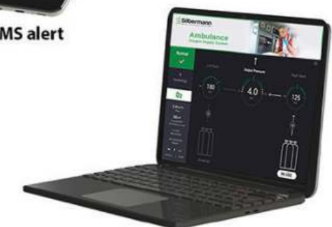
Web remote view on the internet