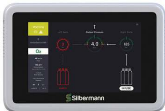
Empty cylinder alert in left bank after supplying oxygen