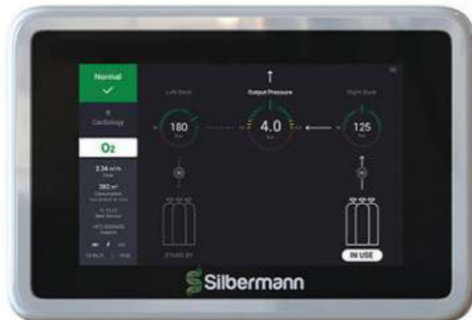
Showing the status in the right bank - In use