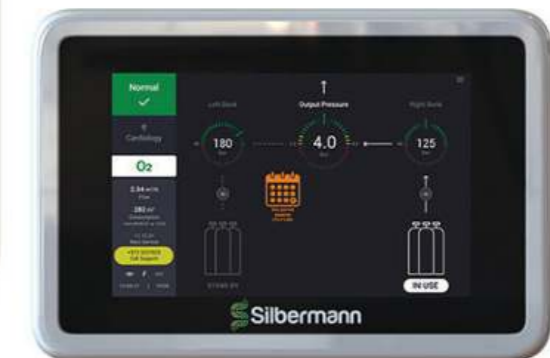
Gas expiration date alert