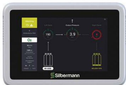
Leak detection alert in the right bank while the left bank supplies oxygen